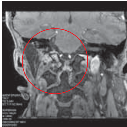
Coronal Reformat – 3D IDEAL