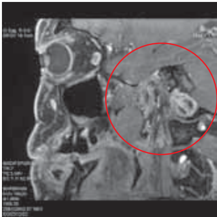
Sagittal Reformat – 3D IDEAL