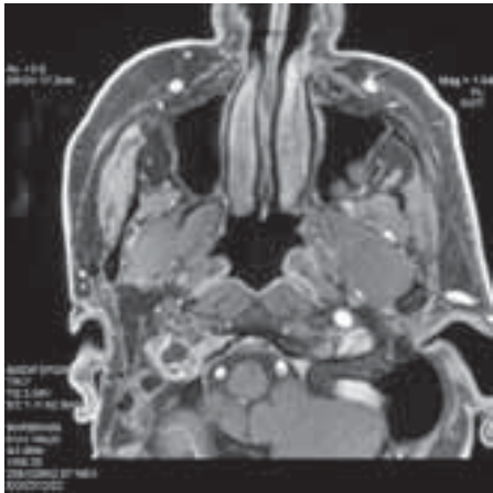
Post Contrast – 3D IDEAL