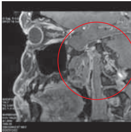
Sagittal Reformat – 3D IDEAL