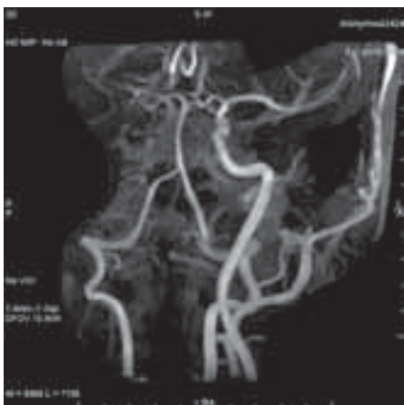
MRA of the neck vessels. Data extracted from the 3D IDEAL data set. Note the missing right carotid vessel.