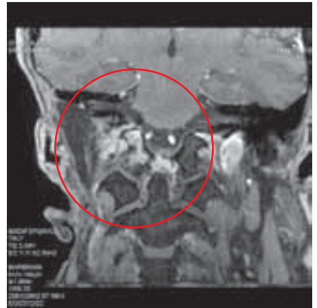
Coronal Reformat – 3D IDEAL