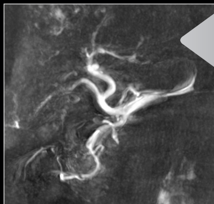
Figure 2: CBCT reconstruction with Motion Freeze