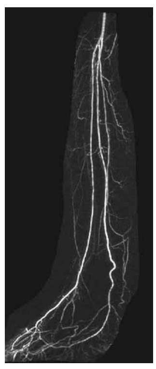
Bolus chase MRA with Image Pasting