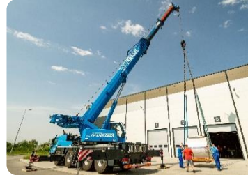
Installation & new OEM parts integration