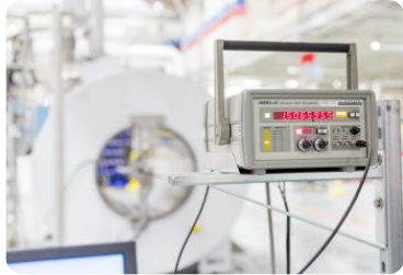
Rigorous magnet selection

Each system goes through an exacting, proprietary process to meet original system specifications and performance quality, using only OEM parts. GE HealthCare manages and owns this entire process relying on GE HealthCare authorized personnel performing to the latest GE HealthCare specifications.