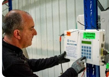
Magnet parameters and helium levels daily monitored and tested