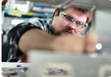
Decontamination, inspection & deep cleaning