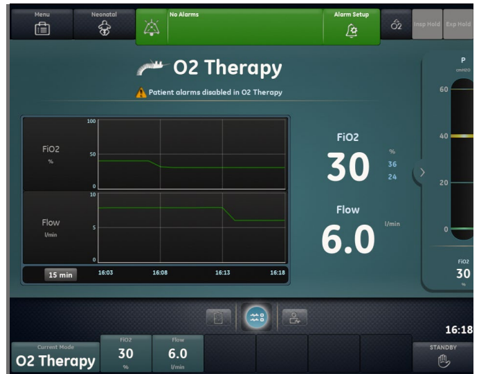
Display screen showing CARESCAPE R860 O 2 Therapy mode.

The O 2 Therapy mode of the CARESCAPE R860 Ventilator was designed for optimal usability. The pressure bar graph that is displayed during mechanical ventilation modes is a helpful indicator of circuit pressure. The display also includes FiO 2 and Flow trend lines, so that clinicians can track changes over time. And for continuity of care, historical views will include data from patients who were transitioned from mechanical ventilation to O 2 Therapy.